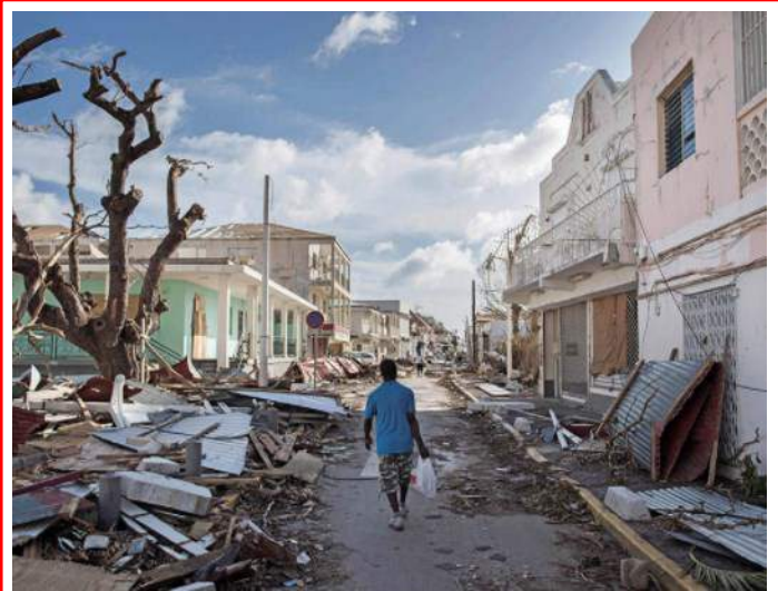
Devastation left behind

As the storm ripped through Miami, waist deep water rushed through the streets at least three blocks from shore. As Irma continued to thrash Florida, aid was sent to the Caribbean