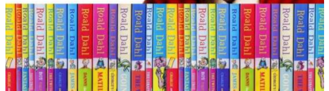
Author of Matilda