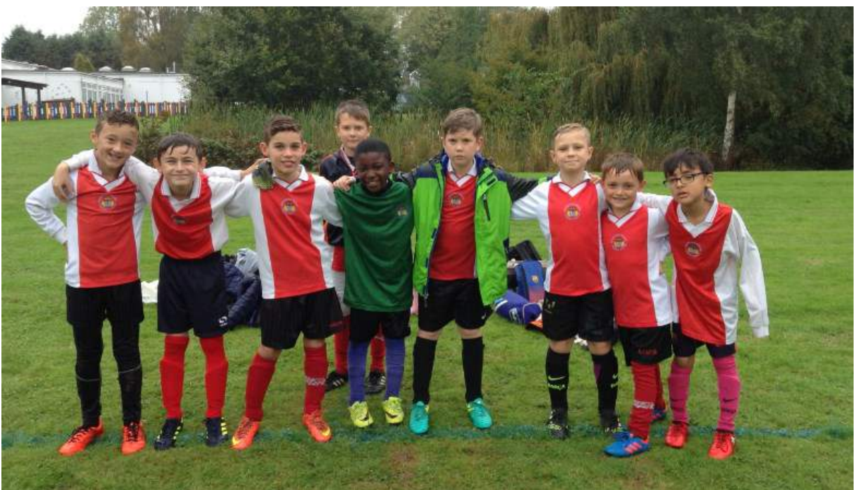
Ernesford Grange Boys Team