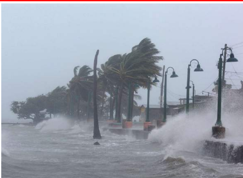
Hurricane Irma Strikes

that it had left behind in its path of destruction.