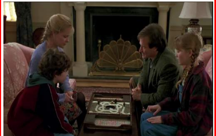
Alan, Sarah, Nora and David playing Jumanji.

Now about the story. Judy and Peter started to play with the newly discovered board game, Jumanji, when Alan, and shortly after him,