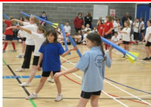
Children taking part in the javelin from schools around Coventry.