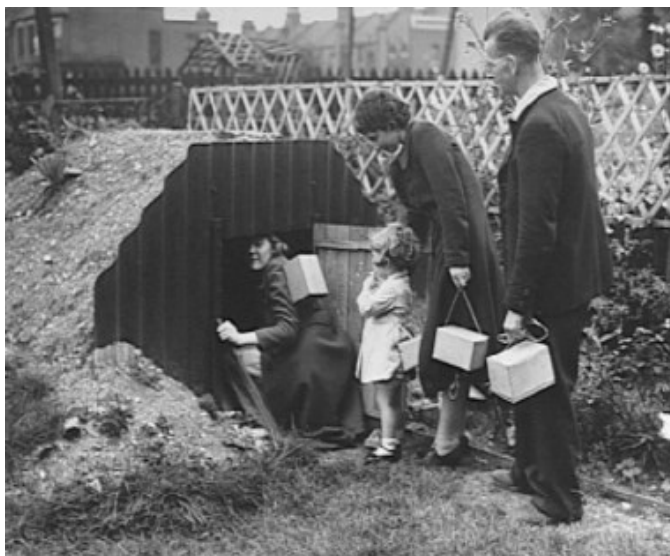
A bomb shelter, also known as an 'Anderson Shelter'.