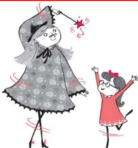
Pandora and her Granny

with hot chocolate and beautiful reindeer cakes. Finally, when they see Santa's sleigh, they are disappointed! The reindeer are dogs and the sleigh is an old pig troll. With one flick of her wand the sleigh turns from old to ornate and the dogs fly. They fly in the sky, in their beautiful sleigh, from their wonderful (yet wacky) winter wonderland!