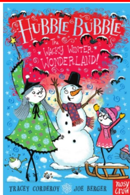
Hubble Bubble – The Wacky Winter Wonderland

Pandora's granny is (Make sure you whisper it... Just in case!) a witch! She loves to sprinkle magic everywhere! One day, they think they are going to visit a winter wonderland, but it's really not. As they enter there is animal poo everywhere, the ice skating rink is made from bubble wrap, the tea is ice cold and the festive food is brussel sprouts! But one wave of her wand, and it turns from wacky to wonderful,