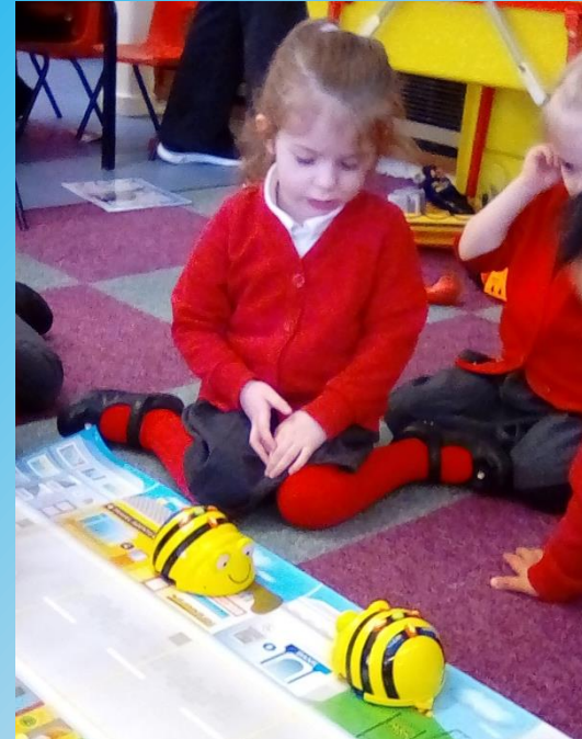
Understanding the World