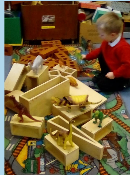
Expressive Arts and Design